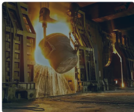
Iron & Steel